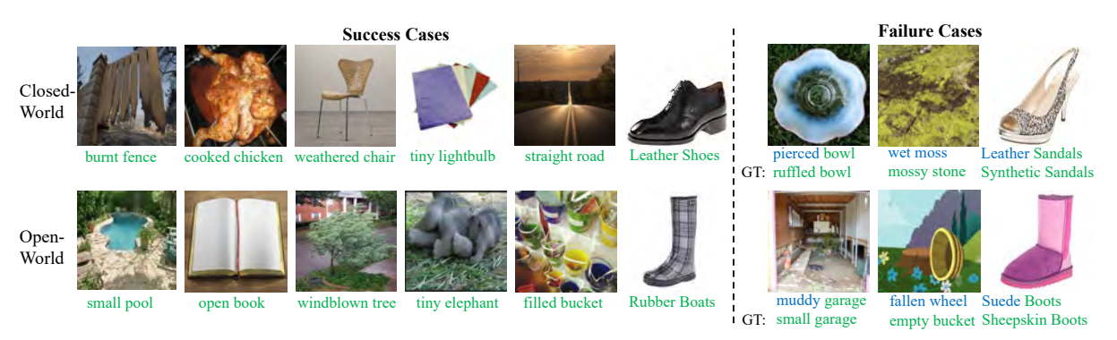
Figure 3. Qualitative results. We evaluate top-1 predictions for some cases on MIT-States and UT-Zappos. The first row shows the results of the closed-world and the bottom row is the open-world. Six cols on the left are examples of successful predictions, and three on the right are examples of failures. For the failure cases, blue denotes the wrong prediction and all images are randomly selected.

with only decomposition section ( DeC ) and with decomposed fusion module ( DFM ). The closed-world and openworld experimental results can be seen in Tab. 3.