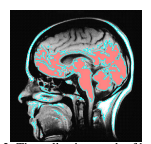
Figure 2: The collective result of brain activities while recapturing dancing skills

As discussed in Section 2, the objective is to study how volunteers respond when they reuse a skill, which they learned at least two years ago but did not practice before the start of experiment. When all the datasets are processed, each API computes a numerical value corresponding to the intensity of each region in brain segmentation. Visualization is the end result of such representation. Figure 2 shows the diagram the collective result of brain activities while recapturing dancing skills. It shows different levels of brain activities in the frontal lobe, parietal lobe, occipital lobe (these three are grey matters, the last one is situated at the back), temporal lobe consisting of corpus callosum and hippocampus (inner brain, the later one controls emotion) and brain stem (middle brain).