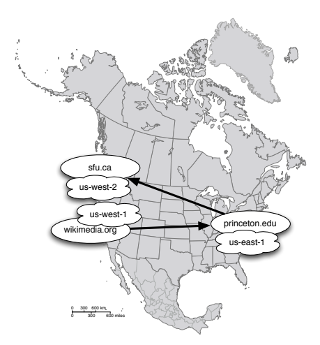
Figure 4. Example workflow with closest Amazon EC2 regions

CloudForecast will take this workflow and build the internal candidate graphs for every metric and Cloud region. After all the metrics tools have terminated, the tool will have essentially labeled all edges in the graphs. Figure 5 is an example of what those internal graphs look like.