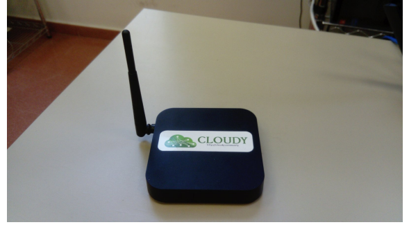
Fig. 2. Device used to build the edge community clouds