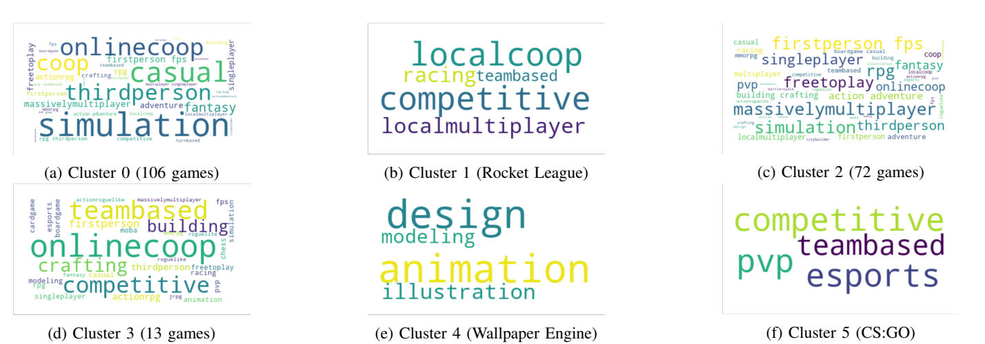
Fig. 2: Word clouds for the 5 game clusters, displaying the frequency of the user-defined tags in Steam.