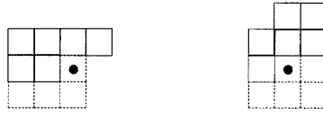
Figure 2: Left) A - and hidden template conditioning transitions to next set of hidden states. Right) B - and hidden template conditioning output probabilities.