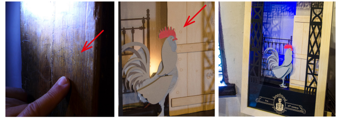
Fig. 3. A volunteer showing us the hidden/witches' marks on the back door (left). Witches' marks featured in the set design (centre and right).

magazine, and to take it with them during their visit to provoke different reactions from the characters in each Tableau. By “showing” the object to the characters (by scanning the object's tag on the stand, Fig. 2), visitors were mixing the different times of the House and prompted the characters to react either by saying something about the object or in more unexpected ways, e.g. an unnerving response from Mary (16 th century) who was startled by and unable to read the magazine. Tableaux and objects were focal points for conversations between the visitors and the House, mediated by its previous inhabitants. Different objects triggered different reactions from the characters, and visitors could show the same object to the same character many times to keep the conversation going. This aimed at shifting the visitors' attention back to the House by engaging the visitors in observation, reflection and conversation with the characters. The tableaux, the objects and the voices of the characters were designed as an ensemble, crafted to create a coherent yet surprising experience. Rather than on developing technology, our efforts focused on designing and implementing interesting content and engaging reactions from the Tableaux when an object was detected, including stories, noises, smells and mechanical movements.