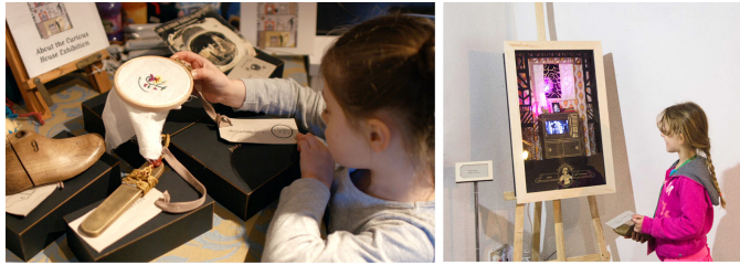
Fig. 2. Visitor selecting one of five objects for her visit (left) Visitor listening to Anne's tableau while holding Tom's shoe last (right).

The concept of an embodied interactive storytelling experience for the visitors was not there at the beginning. Rather, the characters, their stories, their objects and the visitor interaction ideas emerged organically from the co-design process and the activities the first author organised to harvest the creativity of the volunteers. In an iterative collaborative process, multiple design ideas were initially explored and a few concepts selected, such as that of stories from multiple periods told at the same time, or found objects forgotten by the previous inhabitants of the house. The selected concepts were then refined for the final installation. The characters, their lives and their comments were imagined by volunteers in two co-creation workshops. These contributions were then refined into the script that was recorded for the final installation.