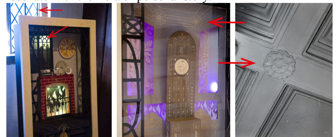
Fig. 4. (left) Joseph's Tableau with the window (right) Mary's Tableau with detail of Tudor rose on the ceiling (centre and left).

skills first, then mentioned Anne, the character from the Sixties: [...] Go and see Anne, at another station and show her the embroidery. I bet she won't believe you when you'll say it's made by hand! Don't forget to come back later! I have more to tell you! Anne, the 1970s character, acknowledged Mary's talent for embroidery, then provoked visitors by mentioning the modern way of doing things: Woow! That's a beautiful flower! I really cannot believe it was made by hand. Why would you spend so much time embroidering when you can use a sewing machine? [...]. When Mary's embroidery was shown to her a second time, Anne shared her personal taste in fashion, which she displayed on her TV set: I prefer printed fabric. Look! What do you think?! When I am older, I want to become a fashion designer! What about you? I want to design beautiful clothes like Mary Quant...do you know her? The third time the embroidery was shown to Anne, a clip of an interview with Mary Quant would play on Anne's TV (Fig. 2, right). Thus, the objects were used as a prompt for conversation and the characters responded with themes (e.g. fashion) that would resonate with their era or personal story.