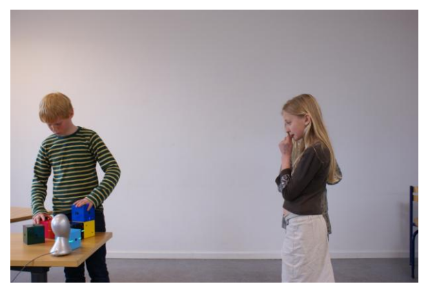
Figure 8. Individual music-making.

3. Individual music-making. In each session we encouraged the participants to create their own musical piece or "mix" (Figure 8), having complete control over the blocks. At this stage it was particularly clear that I-BLOCKS served as a useful tool for musical expression, composition and performance. To a varying degree the participants would examine each block to choose the instrument variation they wanted to use and be very selective in this process. Often they would leave one or two blocks out of the mix in order to receive the output or sound they wanted, avoiding the overall mix getting clustered or "muddy".