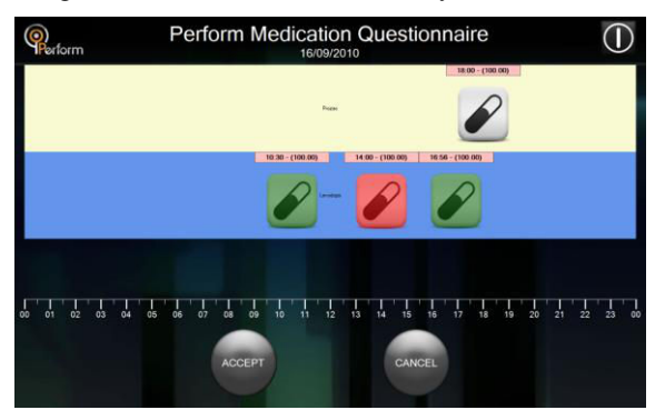
Fig. 2. Medication intake screen. The dose and type of pills is indicated by the appropriate image in order to help the end user remember what kind of medication he/she took and when. By clicking on the prescribed doses the user is able to confirm that the medication was taken at the prescribed time (or declare the real intake time by moving the pill along the horizontal time line). The user can also declare the dosage taken. In order to add a medication intake that was not scheduled, the user can click on the empty space of the desired medicine rectangle.

PERFORM is a telematic platform for PD remote monitoring developed in the last years by a European Consortium of SMEs, large companies, Universities and research centers [8]. The current status of the project is a fully operative prototype which has been tested in three different hospitals across Europe: University of Navarra Medical School Hospital (Spain), the University of Ioannina Hospital (Greece) and the Nuovo Ospedale Civile S.Agostino-Estense of Modena (Italy).