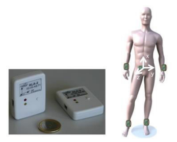
Fig. 1. Sensors used for data collection and their position over the patient's

movements. As the disease evolves, PD patient's motion becomes slower and tremoric and the response to medication fluctuates along the day (ON-OFF periods). In addition, the presence of involuntary movements (dyskinesias) deteriorates voluntary movement in advanced state of the disease.