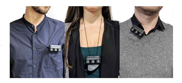
Fig. 1. BioEssence is a wearable olfactory display that can be worn as a clip or as a necklace. The device can easily be attached to pockets, shirt necklines, jewelry threads, and cords.

MIT Media Lab, Cambridge, MA 02141 USA. {amores, javierhr, artemd, xiqwang, pattie}@mit.edu