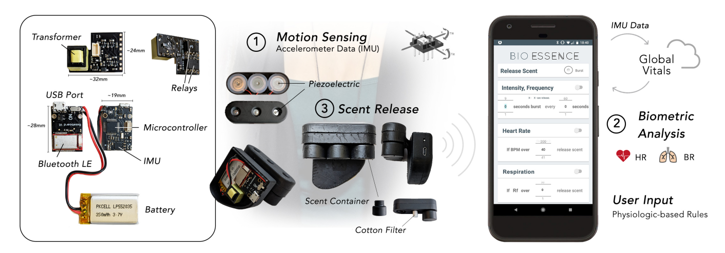
Fig. 2. Overview of the main components and flow of information: 1) the accelerometer inside BioEssence captures subtle chest vibrations and sends them to the smartphone application via Bluetooth Low Energy (BLE), 2) the information is sent to the cloud-based Global Vitals API which returns heart rate (HR) and breathing rate (BR) measurements, and 3) the application uses the physiological information and the user input to release scent accordingly.

be influenced by different factors (e.g., hair, tattoos). In addition, some of the sensing methods require the use of pre-gelled electrodes which may irritate the skin and may not be acceptable for certain populations (e.g., children, patients with burn injuries). A less invasive method involves monitoring subtle body vibrations associated with the beating of the heart and the movement of the blood (i.e., ballistocardiography and seismocardiography) [12]. This approach has recently gained more attention as it allows to monitor vitals passively and through clothes [13]. One method to monitor motion involves using wearable motion sensors such as accelerometers and gyroscopes which are pervasive in offthe-shelf devices (e.g., [14], [15]). Indeed, there have been some studies demonstrating the possibility of using motion sensors on the sternum to capture physiological signals (e.g., [16], [17]). Motivated by these studies, this work relies on an accelerometer contained inside the olfactory display to comfortably capture cardio-respiratory movements.