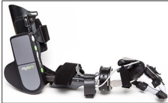
Figure.1. A myoelectric upper extremity orthosis (MyoPro)

in a patient with iSCI. Given the significant relationship between UE function and quality of life, independence, self-esteem, and community integration in individuals with neurological disability, rehabilitation modalities for the UE should serve to significantly improve multiple aspects of ADL [12, 13]. A promising device, such as the MyoPro, would be expected to improve everyday functioning and reduce the impact of injury/disease on the lives of individuals with neurological disorders. While robotic training is relatively a new approach and is developing day by day, several studies (mostly on stroke survivors [14-17]) have demonstrated the efficacy of UE-WRO across many domains of motor function and ADL. A case report on an individual with SCI demonstrated improvements in UE strength, tone management and ADL following UE-WRO utilization [18]. Another case report on individuals with SCI showed UE function improved after 4 weeks robotic assistance intervention. Manual muscle test scores for wrist extensors, finger flexors and finger abductors significantly increased[19]. Therefore, the overall goal of this study was to evaluate the effects of UE-MPWO (MyoPro) when utilized for in-clinic rehabilitation combined with at-home daily use in improving UE movement and function people with iSCI.