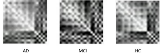
Figure 1. Greyscale 21x21-pixel images (not to scale) representing the correlation matrix computed across all channels from 5s data epochs for one subject from each class.

The resulting dLZC matrix was of dimension 21x21, with each value representing the dLZC values computed for every electrode channel pair combination. These matrices were converted into 21x21-pixel greyscale images. Fig. 2 shows an example of these images for one subject from each of the three groups.