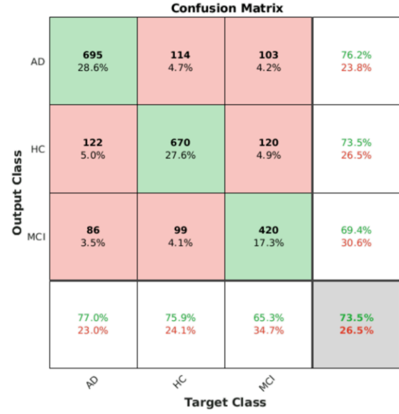
Figure 4. Confusion matrix for the best performing epoch length trials (10s) when images derived from dLZC between electrodes were used as the model input to AlexNet.