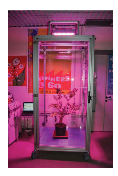
Fig. 1. The iTreeBox plant growth chamber

The experiments were performed inside a closed growth chamber, the so-called iTreeBox, in order to control the ozone concentration and the other environmental parameters. Inside the box plants were exposed to standard artificial light conditions by means of LED lights responding to the plants photosynthetic needs (PAR radiation). About 50 cm high plants of Ligustrum texanum and Buxus macrophilla were used for the experiments and each plant was placed in the box and exposed to ozone stimulus one at a time. Electrical sig-