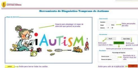
Fig. 3 Graphical User Interface (GUI)

M-CHAT is a tool that was created with the intention of improving the sensitivity of CHAT. It consists of 23 questions dichotomous yes-no answers, of which 9 correspond to the original CHAT and has an aggregate of 14 questions related to the core symptoms present in very young children with autism.