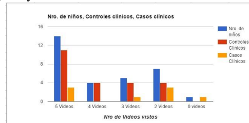
Fig. 4 Number of watched videos vs. number of children vs. controls and cases

As shown in Table 1, a higher rate of clinical controls and clinical cases could observe the five videos displayed by the software.