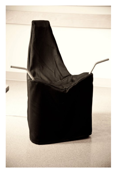
Figure 2:The Emoti-Chair