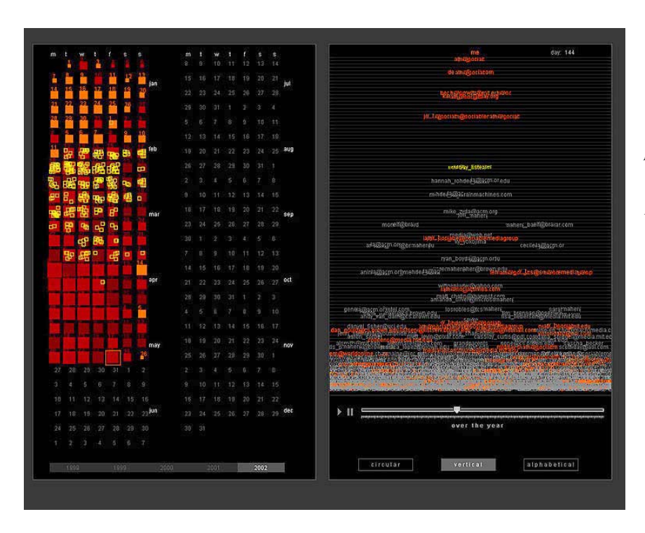
Fig 1. PostHistory interface with calendar panel on the left and contacts panel on the right. A contact name has been highlighted and the corresponding emails sent by this person have been highlighted in yellow on the calendar pane