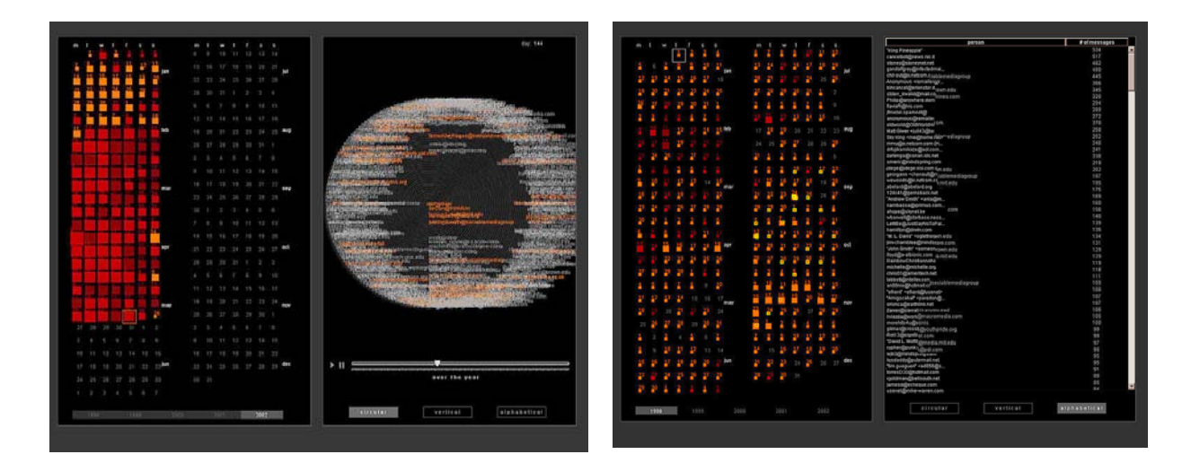
Fig 2. PostHistory's circular mode of the contacts panel