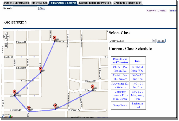
Figure 3. Campus route planner mash-up built by students to help plan a class schedule.

As a preliminary investigation of this, one of the authors recently taught an undergraduate course on Web Technologies as part of a Minor in Information Technology Studies. Students were sophomores, juniors, and seniors from a range of majors including graphic design, psychology, political science, finance,