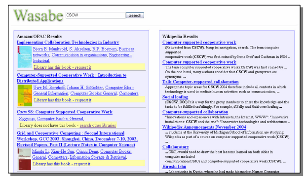
Figure 2. Wasabe mash-up prototyping a hybrid library catalog search.

Two subsequent revisions have been made to Wasabe to connect the search results to our university's library catalog system. The second