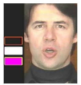
Figure 1. An example of the video display with the visual features. The top nasal bar indicates the nasals by lighting up orange during the period they occur. The middle voicing bar indicates voiced sounds by lighting up white and the bottom frication bar lights up when there is frication noise. The intensity of each cue corresponded to the degree to which the corresponding acoustic feature was present in the speech signal.