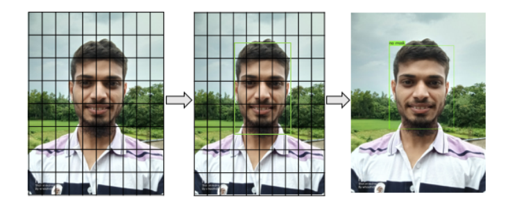
Fig. 5. Workflow of YOLOv3.

2) Applied YOLOv3: An input here is an image is passed into the YOLOv3 model. This object detector is going through the image and find the coordinates that present in an image. It's basically divides the input into a grid and from that gird it'll analyzes the target objects features. From the neighboring cells that features were detected with high confidence rate are add at one place for produce model output. Fig-5 shows how YOLOv3 works in our purpose.