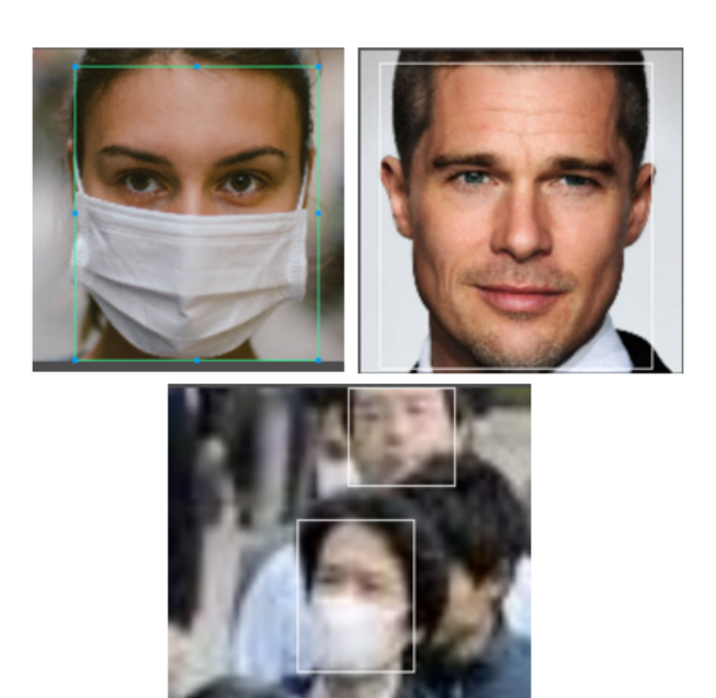
Fig. 3. Bounding Boxes.

The Fig-3 below shows some images that we have annotated.