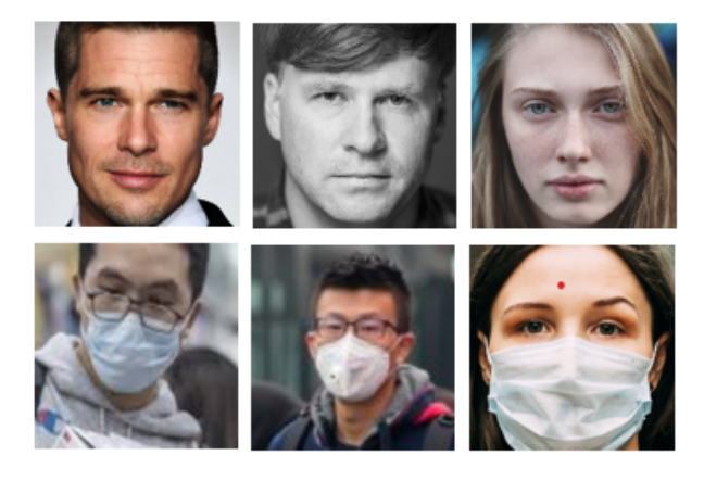
Fig. 2. Dataset.

Data is really important in data driven techniques like machine learning, deep learning. The more the data the more the better result. For our purpose of working with YOLO we also need more data and with proper annotate. But for our work we don't find any type of annotate data. Using web-scrapping tool from website we have collected 650 images of both mask and no-mask. Further annotation part discussed in data annotation section. Next our data is not suitable for fed into the model. Before feeding we do some pre-processing. There are some irrelevant images inside the dataset. We remove them & finally got our dataset with 600 images where 300 for mask and rest for no-mask. Fig-2 shows the sample of our dataset.