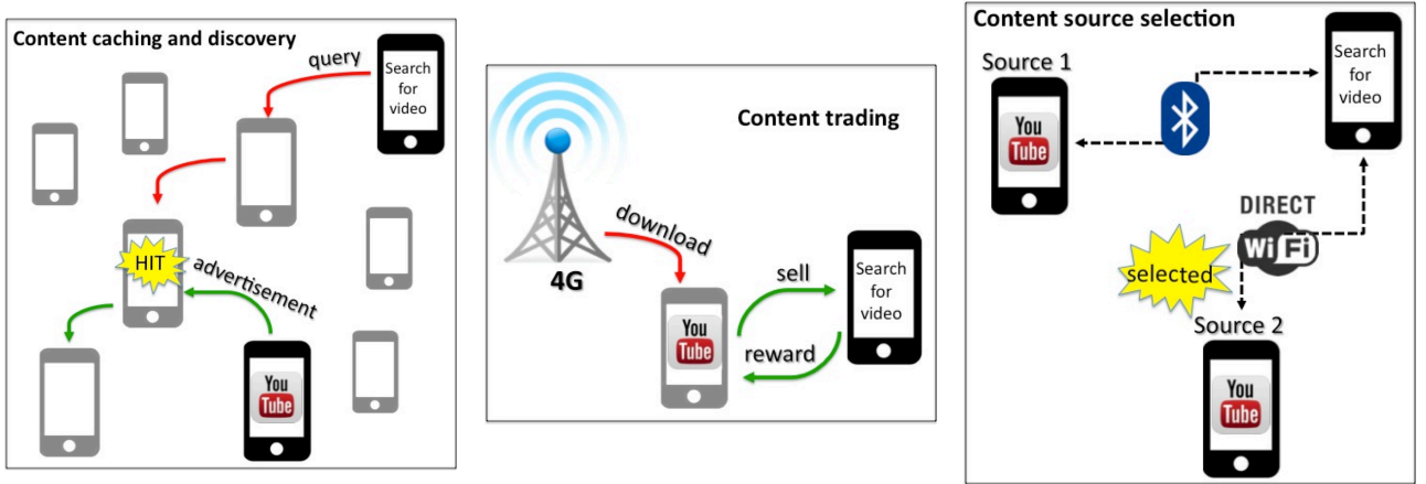
Fig. 2. System functionalities needed to enable content orienteering and efficient data delivery in a network based on D2D communications.