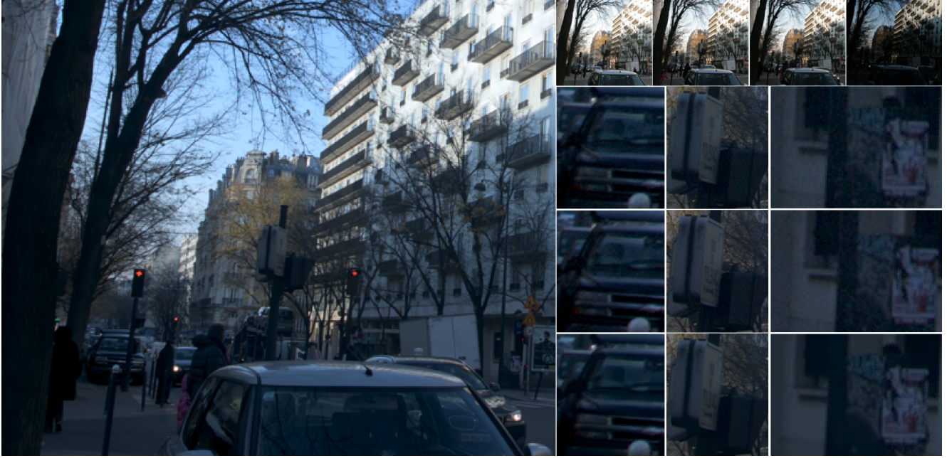
Figure 7: Real data. Dynamic scene (pedestrians in the street and moving cars) acquired using a hand-held camera. Left: Tone mapped irradiance estimation using the proposed non local approach. No ghosting artifacts appear. Right first row: Input images (JPEG version). Right second row: Extracts of the normalized reference image. Right third row: Extracts of the results by Sen et al. [26]. Right fourth row: Extracts of the results by the proposed non local approach. The result obtained by the proposed approach is significantly less noisy than the one by Sen et al. Please see the electronic copy for better color and details reproduction.