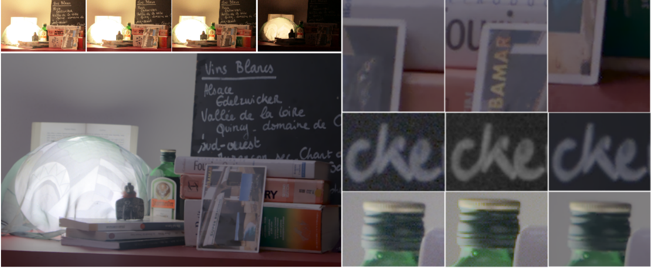
Figure 5: Real data. Static scene except for one moving object (the postcard) acquired using a hand-held camera. Left side. First row: Input images (JPEG version). Second row: Tone mapped irradiance estimation using the proposed non local estimation approach. Right side. First row: Extracts of the moving object (the postcard). No ghosting artifacts appear. Second / Third row: Extracts of the normalized reference image (left), the method by Sen et al. [26] (center) and the proposed non local approach (right). The irradiance estimation of the proposed approach is considerably less noisy than the one obtained using the reference frame only or the method by Sen et al. Please see the electronic copy for better color and details reproduction.

ing technique manages to remove part of the noise on the bright regions but at the cost of blurring the dark zones.