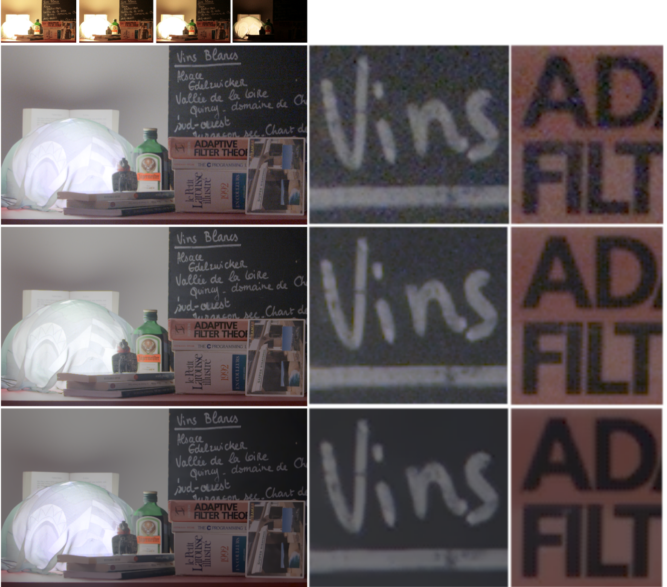
Figure 4: Real data. A static scene is acquired using a static camera. First row: Input images (JPEG version). Second row: Tone mapped reference image normalized by the exposure time. The saturated regions of the reference image were filled using the Poisson editing patch based approach described in Section 3.1.4. Third row: Tone mapped irradiance estimation by the MLE approach [10]. Fourth row: Tone mapped irradiance estimation of the proposed non local estimation approach. The result of the non local approach is less noisy than the one obtained using MLE. Thus releasing the alignment hypothesis does not have a significant impact on the algorithm performance. Recall that some demosaicking artifacts may appear due to the basic used technique. Please see electronic copy for better color and details reproduction.