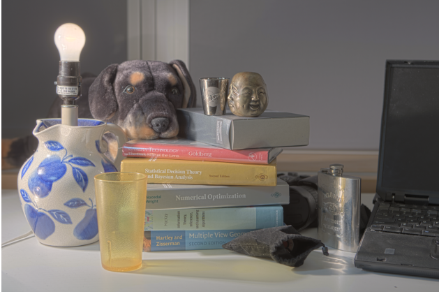
Figure 2: Tone mapped version of the HDR image used as ground-truth for the synthetic test presented in Section 4.1. From [13].