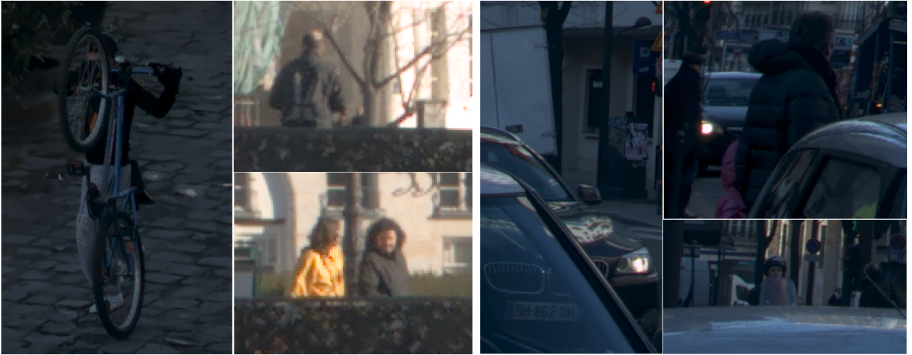
Figure 8: Real data. Extracts of the results obtained by the proposed non local estimation method for moving objects present on the scenes of Figures 6 (left) and Figure 7 (right). Notice that no ghosting artifacts appear in neither example.