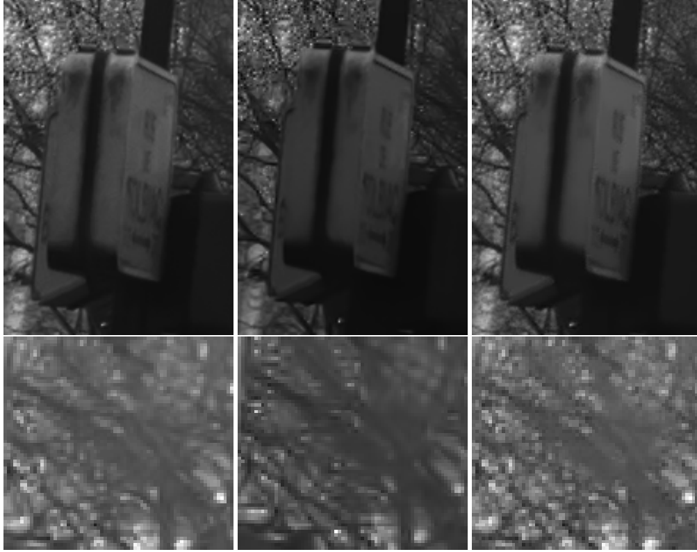
Figure 9: Real data. Left: Extracts from the NL-MEANS denoising of the normalized reference frame. Center: NL-MEANS denoising of the result by Sen et al. Right: Proposed non local approach. The proposed approach manages to better denoise the bright regions (see the street panel) while better preserving details on dark regions (see the tree branches). On the contrary, this is not the case for the two other examples. The denoising technique manages to remove part of the noise on the bright regions but at the cost of blurring the dark zones. Only the green channel irradiance is displayed in order to avoid contrast changes introduced by the tone mapping techniques (needed to display HDR color images) and better visualize noise level differences.