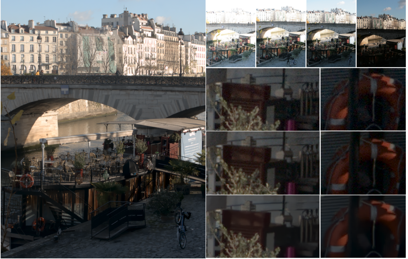
Figure 6: Real data. Dynamic scene (pedestrians in the bridge and people next to the boat) acquired using a hand-held camera. Left: Tone mapped irradiance estimation using the proposed non local approach. No ghosting artifacts appear. Right first row: Input images (JPEG version). Right second row: Extracts of the the normalized reference image. Right third row: Extracts of the results by Sen et al. [26]. Right fourth row: Extracts of the results by the proposed non local approach. The result obtained by the proposed approach is far less noisy than the one by Sen et al. Please see the electronic copy for better color and details reproduction.