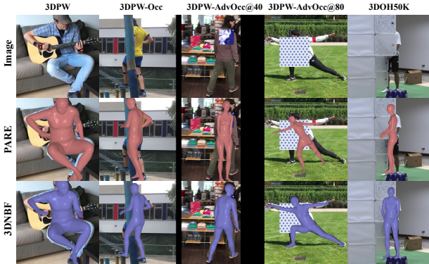
Figure 3: Qualitative results on evaluated datasets.