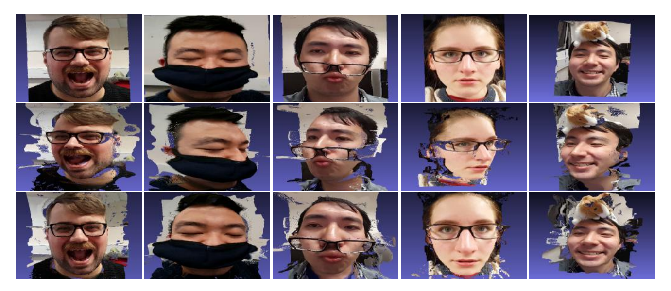
Figure 5: From top to bottom: reference view, novel unseen views and perspective-aware portrait photos manipulation based on the depth map obtained from our method.

tion, which is achieved by 3D facial performance tracking and expression coefficient clustering. Our method can be adapted to many applications that require 3D information of the face.