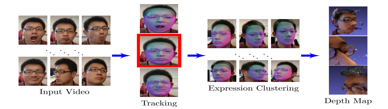
Figure 1: Given a video, a parametric 3D model [6] was fitted to noisy 2D landmarks produced from the off-the-shelf 2D landmark detector[21]. The fitted 3D model is used to refine the 3D position computed from the 2D landmarks via robust photometric tracking. The tracked 3D mesh are superimposed on the image. After clustering, video frames of similar facial expressions as seen at different viewing angles are used to compute a complete and smooth dense depth map. The glasses and hair are well reconstructed.