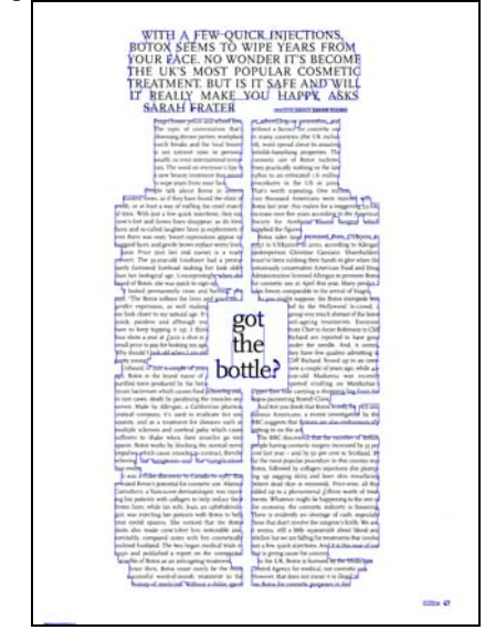
Figure 2. Sample page image from the training dataset showing superimposed description of region contours.

It is the view of the organisers that the above categories represent a subset of documents that are both realistic in their frequent occurrence and, at the same time, of general interest to analyse.