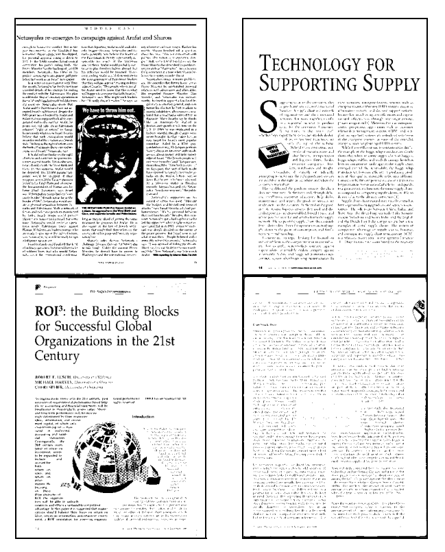
Figure 1. Sample page images from the training dataset.

are genuine. This can be more so if the evaluation system is publicly available. In this case, the evaluation system was not published (only the principles) and above all, the organisers have faith in the authors' scientific integrity.