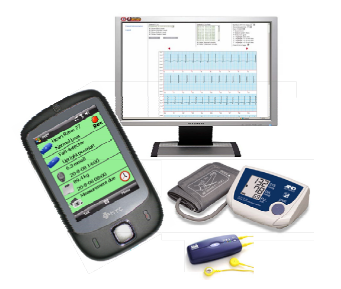
Figure 2. Personal Health Monitor

In Section II a generic architecture for m-health systems is presented. In III this architecture is used to compare the two systems. Section IV describes the clinical applications developed so far by the two teams, V compares experience with users and VI presents discussion and conclusions.