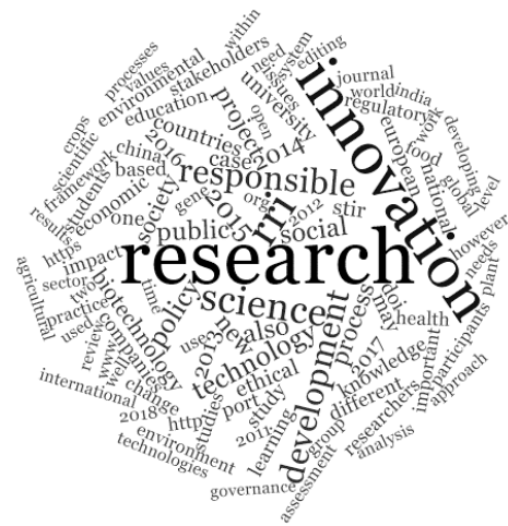
Fig. 3. Word cloud formed from articles’ reviewed

This result is understandable because the words ‘science’ and ‘technology’ are related to research and innovation. ‘Development’ is related to innovation that are useful in developing knowledge as well economics. The ‘policy’ relates to two dimensions in RRI namely anticipation and responsiveness.