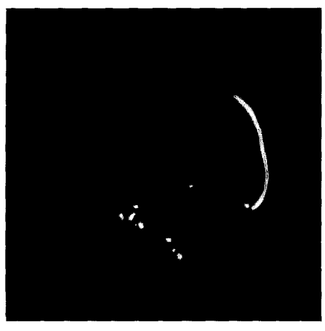
Fig. 1. Slices through unprocessed MRA data (the gray-value histogram was adjusted for better visibility).