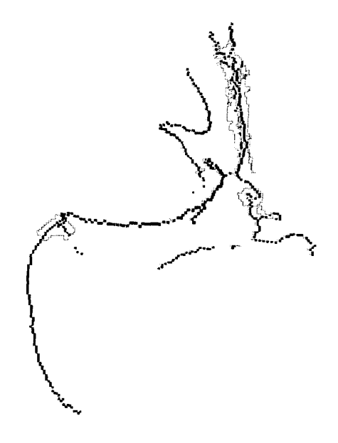
Fig. 3. Skeleton of the cubical complex of the blood vessels, and one-generators.