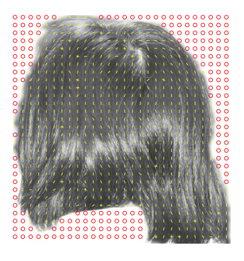
Fig. 4. Estimate the orientation field of hair

Fig. 3 . Multiple orientations estimation applied to texture image. Left: texture image. Middle: orientations of the left obtained by the proposed approach. Right: orientations of the left obtained by [11].