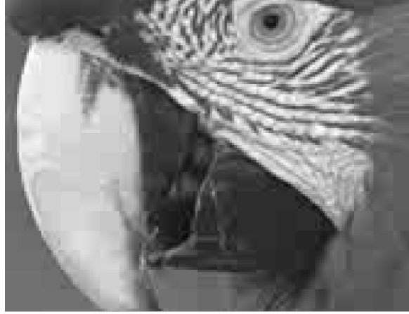
(a) DCT 8 \times 8