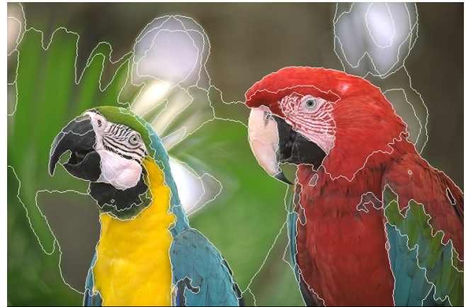
Fig. 1. An image divided into 100 regions by the proposed algorithm.

To solve this problem, in the past years different solutions have been proposed. Some variations of the DCT have been developed, such as directional DCT [2], adaptive block-size transform [3] or shape-adaptive DCT [4], in which the block size and shape are defined taking into account the edge location or the transform is evaluated avoiding to cross edge discontinuities. Wavelet approaches have also been introduced. To avoid filtering across edges, researchers have studied different wavelet filter-banks based on the image geometry, e.g. bandelets [5], directionlets [6] and curvelets [7]. However, all the proposed methods produce an efficient signal representation only when edges are straight lines, making them inefficient in presence of shaped contours. Recently, a novel graph-based transform approach has been proposed. Any image can be viewed as a graph, where each pixel is a node of the graph and weighted edges