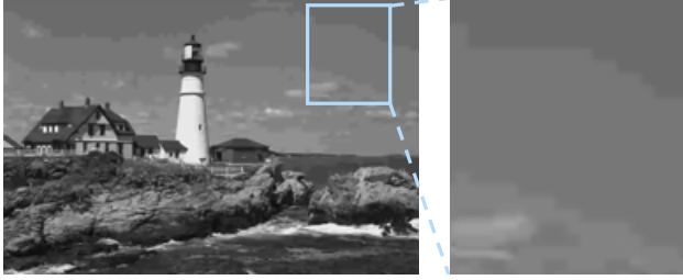
Fig. 1. The banding effects can still be clearly seen after the process of ARCNN (QF=10).

performing the restoration. Noting that local information is sometimes not enough to remove all the artifacts, especially the banding effects, which can appear at a large scale on the image. As shown in Fig. 1, due to the quantization step of JPEG, the sky in the image is split into multiple bandings, and ARCNN fails to recover the bandings because of small receptive fields.