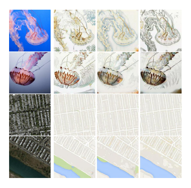
Fig. 3 . The columns from left to right are original image, CycleGAN, GAIT ( c_{ga} = 1 ) and GAIT ( c_{ga} = 2 ) results for different images

The Kernel Inception Distance [14] is used to evaluate the proposed framework quantitatively. KID calculates the squared maximum mean discrepancy between the Inception network [15] features of real and generated images.