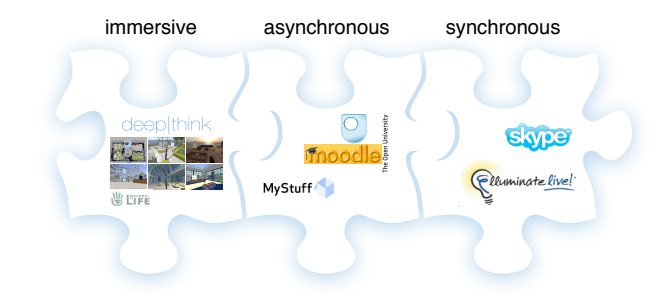
Figure 3. Overview of the technologies adopted