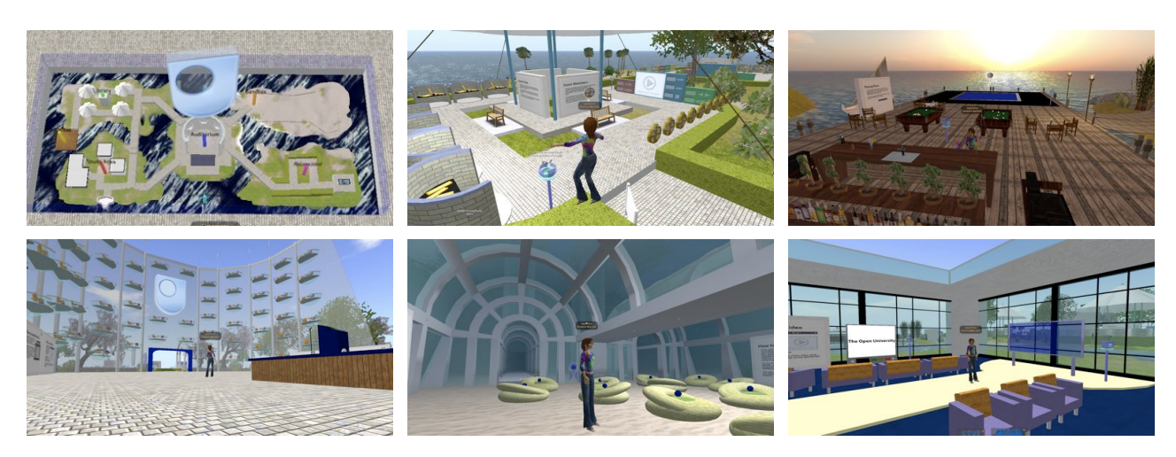
Figure 4. Snapshots of deep|think. Clockwise from top-left: 3D map of deep|think; Library Search Area; Beach Bar; Students' Common Room; Underwater Theatre; Main Amphitheatre

rethinking of the original requirements might be necessary. The eMPhil project leader and her counterpart on the software development team, agreed that an Agile approach [1] to development should be taken, with frequent customer-developer interaction and short incremental iterations driven by user requirements. The time scale for the project was rather compressed with 90% of the development carried out within 6 weeks.