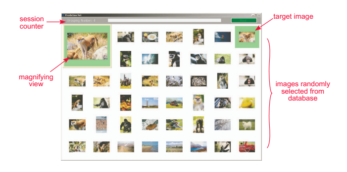
Fig. 1. The interface for data collection of user feedback.

vendor-defined categories. Fifteen subjects were asked to form a group of images from 44 images on the screen, one of which is highlighted to indicate the target image (See Figure 1). The only instruction given was to select images "similar" to the target image and to each other. The similarity criterion or the number of similar images to be selected was not specified. Our data collection program is designed to imitate content-based image retrieval processes. The displayed images are intended to be initial retrieval results where a user is seeking images represented by the associated target image.