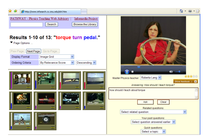
Figure 1. A Pathway page with SI at right, Informedia digital video library search results at left.

The evaluation of Pathway to date has been a combination of Contextual Inquiry and Heuristic Evaluation at physics teacher workshops and at professional meetings where we have made the system available to potential users, feedback for individual users, and the beginnings of an analysis of the questions which teachers ask of the system. Users of the system have had very positive comments, especially noting the effectiveness of searches and the ability to annotate video in the digital video library. In general, teachers who are relatively new to physics teaching have found the natural language "interviews" useful and at least as impressive as the video library. One-on-one interactions with a mentor are extremely valuable. However, teachers cannot be available 24 hours a day to answer questions from dozens of students, even via technologies like chat rooms.