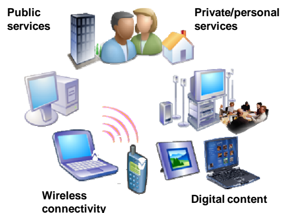
Figure 1 Connectivity and mobility scenario delivering smart applications.

the domains showing an inherent complexity, where smart things create substantial economical or social benefits with respect to current practices.