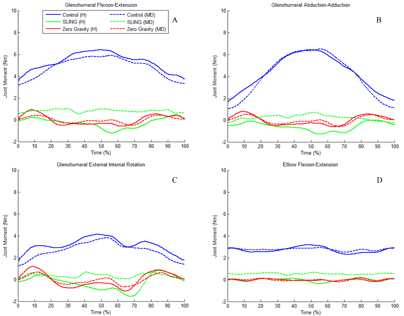
Fig. 2A-D. Glenohumeral and elbow joint moments for the two groups. Positive moments are Flexion, Abduction and External rotation.

The glenohumeral joint moments are shown in Fig. 2 ABC. The three conditions are shown for the healthy group (H) and the MD group (MD) per joint plane. The tasks started at 0% and ended at 100%. The target was reached at approximately 55% for the task with and without support of the SLING. At the beginning of the movement (0%) the elbow was flexed at about 90 degrees with the hand in front of the subject at table height. In the Control condition the shoulder flexion moment at 0% and 100% was lower because the arm was held in a posture with lower elevation. In the Zero gravity condition, the moments at 0% and 100% were almost negligible. When the arm was moved towards the target, the shoulder moments in the SLING condition were lower than in the Control as the arm was pulled upwards. For the Zero gravity condition, the arm needed to be accelerated and decelerated, resulting in a positive and negative shoulder moment. The arm was then moved back to the starting position, resulting in decreased shoulder moments and a minimum at 100% for the Control condition. In the SLING condition the healthy participants generated higher negative