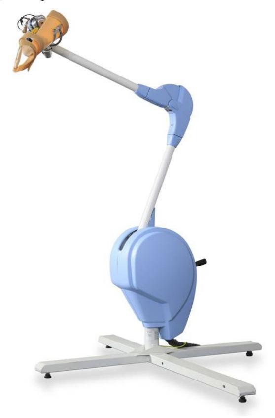
Figure 1. Prototype of the Active Therapeutic Device (ATD).

For this purpose, a new hybrid Active Therapeutic Device (ATD) is being built, see Fig.1. The ATD will consist of a robotic manipulator with the main purpose to support the arm. Besides counteracting gravitational forces on the arm, the ATD can also provide small assisting or resisting forces by tilting the supporting force vector. A manually adjustable spring delivers a constant primary supporting force. Electric motors apply secondary variations to the magnitude and direction of the primary (supporting) force. Due to these variations in magnitude and direction of force, several training modalities are possible, such as actively assisted training, actively resisted training, and haptic simulation.