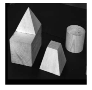
Figure 2: Initial pair of stereo images of a multi-object scene.

els overlaid on the image potential. They demonstrate that our technique is able to continue the tracking even when one of the blocks becomes partially occluded and then disoccluded. Note that those active model nodes which are temporarily occluded are automatically identified and made inactive.