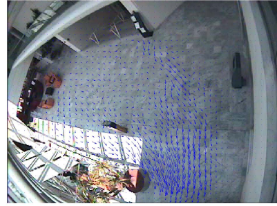
Figure 1. Eigenflows for the normal training set (first eigenvector).

emergency event are shown in Fig.3.(b). There is a clear and quick drop in the likelihood function less than 100 frames (4 seconds) after the exit blocking. The size of the observation window used to compute the likelihood in Fig.3 is 50 frames. Larger window sizes tend to smooth the likelihood function reducing the sensitivity of the detector. The detection threshold Th_{Ab} is defined as a value smaller than the minimum likelihood value present in the normal training set. In order to evaluate the influence of the number of eigenvectors J in producing a likelihood drop to be detected using Th_{Ab} another experiment using 5 independent simulation runs for the blocked exit event are produced, with 3000 frames per sequence and the blocking occurring at frame 2000. The comparison is based on the average likelihood for each sequence before and after the event and is summarised in Table 1. The trend shows that the best detection performance is achieved with J = 10 . However, it is necessary to correctly select the appropriate number of eigenvectors carefully.