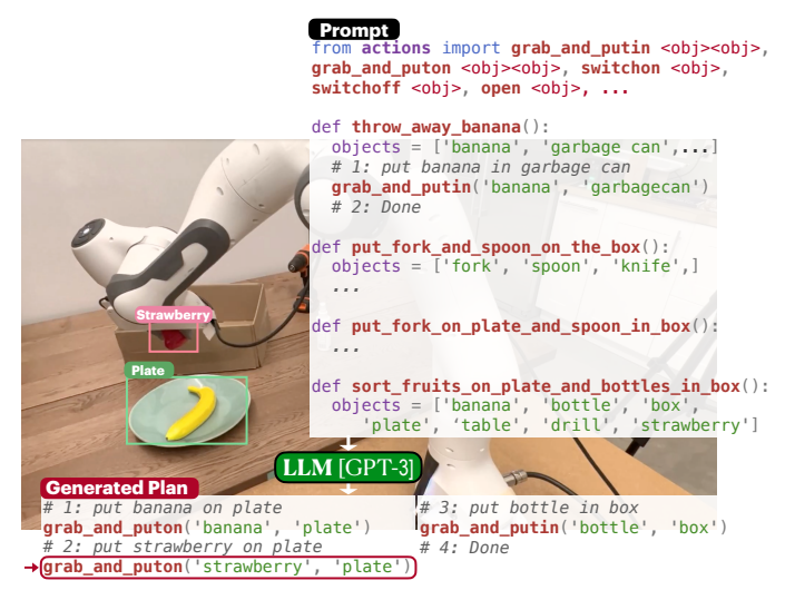
Fig. 1: PROGPROMPT leverages LLMs' strengths in both world knowledge and programming language understanding to generate situated task plans that can be directly executed.

Correspondence to: ishikasi@usc.edu This work was done while IS was an intern at NVIDIA <sup>1</sup>University of Southern California, <sup>2</sup>NVIDIA