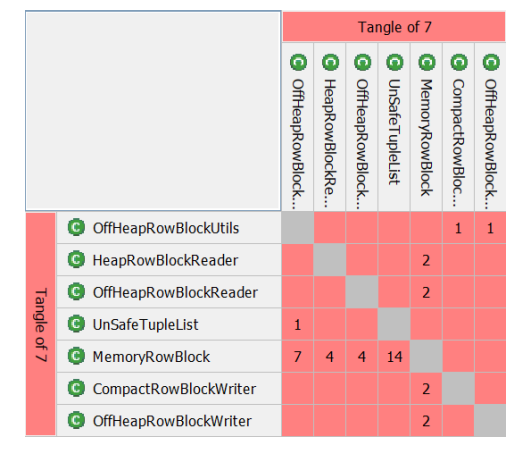
(a) A Tangle Detected by S101

We observed similar discrepancies from file-cycle data. In terms of the number of cycle-involving files, DV8 is close to $101, but DES reported about 50% fewer files. For example, in DeltaSpike, DES, DV8 and $101 reported 15, 33, and 45