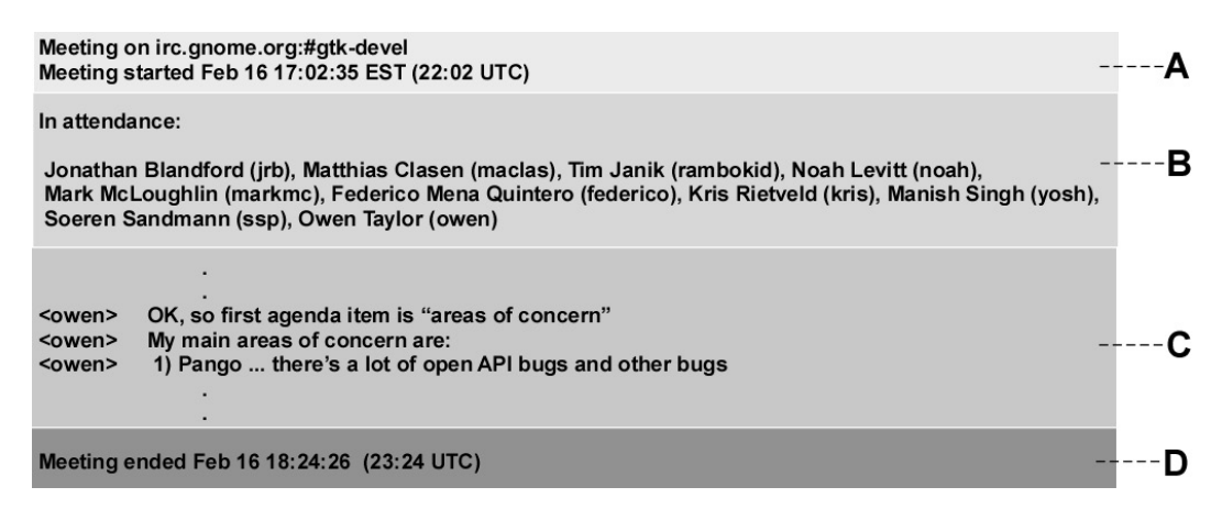
Figure 4: Sample IRC meeting log

The Evolution project started archiving their IRC meeting logs in 2005. The logs for 2006 were not available on their web site, therefore, in our study we use the IRC meeting logs from the years 2005, 2007 and 2008. The IRC meeting logs for the GTK+ project were archived since 2004 till present. In our study, we considered the logs from the time they were first archived till the end of December 2008.