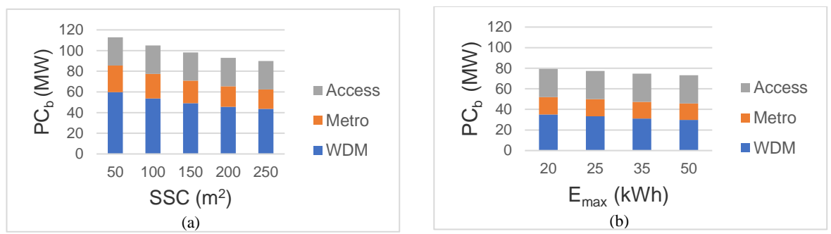
Figure 3: (a) PC_b with renewable-powered CDCs and partially solar-powered FDCs with different SSC values, (b) PC_b with renewable-powered CDCs and partially solar-powered FDCs with ESDs.

C. Power consumption with fully renewable-powered CDCs and caching in renewable-powered FDCs with ESDs: In this case we consider optimizing the streaming of VoD from cloud or fog data centers with PUE_f of 1.1 and SSC of 250 m^2 while optimizing ESDs usage. Figure 3b shows the total PC_b per day when considering different capacities for Li-ion batteries. The results indicate that additional savings by up to 14% can be achieved in the transport network relative to case B for solar cell size of 250 m^2 . The increase in power savings values is due to optimizing the direct use of solar power in the FDC or charging the ESD for the use when it is not available.