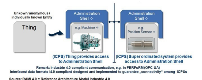
Figure 3: Industrie 4.0 component is an ICPS-component.

components into ICPS-components, i.e., I4.0-components, as briefly described in Figure 3, using the architectural rules addressed by the Reference Architectural Model Industrie 4.0 (RAMI4.0) [24]. In this perspective, robots and machinery became Industrie 4.0 ICPS components comprising the "Thing" itself and the "Administration Shell".