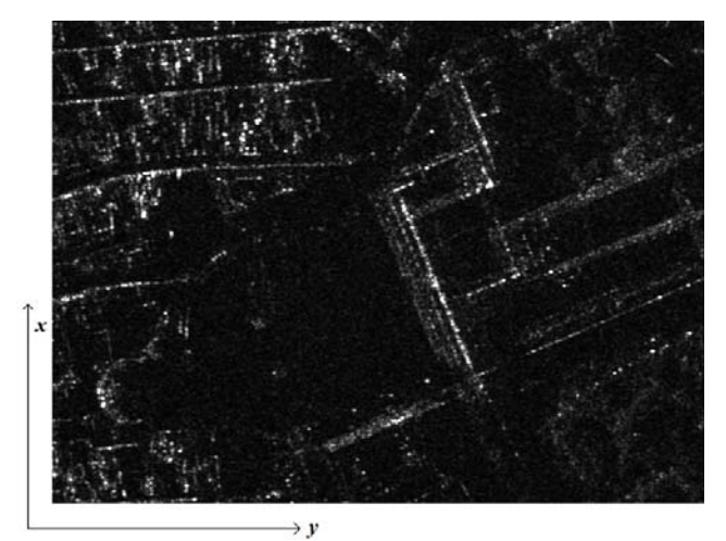
Figure 1 – High Spotlight TerraSAR-X image of Piazza del Plebiscito, Naples.