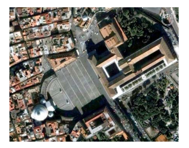
Figure 2 – Aerial view of Piazza del Plebiscito, Naples.

2008 on the city of Naples: Piazza del Plebiscito is clearly represented with Palazzo Reale on the right side. SAR image resolutions in azimuth and ground range are: \Delta x=1.255 m and \Delta y=1.486 m. An aerial view of the square is also provided in Fig.2 while, in Fig.3, the main façade of Palazzo Reale is shown.