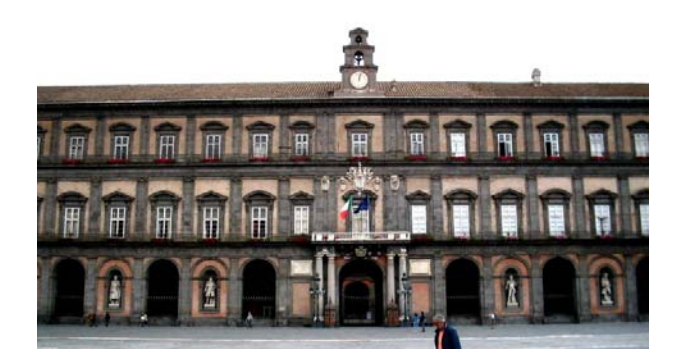
Figure 3 - Main facade of Palazzo Reale, Napoli.

The other three peaks may be related, in order from right to left in Fig.4, respectively to the banister of the long balcony at the first floor (and not to the dihedral configuration presented there as, according to the electromagnetic model in [2], the relative contribution should be much smaller being directly proportional to the height of corner reflector), to the same effect at the second floor and to the edge formed by the façade and the roof. To prove this hypothesis, measures have been taken on the SAR image and then compared with the expected ones deriving from the models