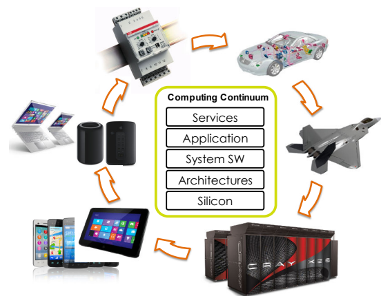
Figure 1: The computing continuum

susceptibility to transient faults (soft errors) and permanent faults (device degradation, wear-out) [2]. One of the biggest challenges for future technologies is the implementation of “dependable” systems on top of significantly unreliable components, which will degrade and even fail during normal lifetime of the chip.