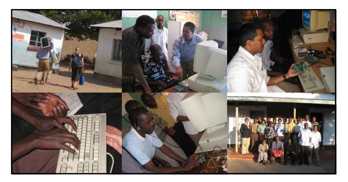
Figure 4: Field Tests at the Sefula School in Zambia

Each student who worked with the BWT at the Mathru School was asked if: (1) they wanted to continue with the BWT, and (2) they liked using the regular slate and stylus better than the BWT. 22 students were tested on the BWT at the Mathru School and all of them agreed with (1) and disagreed with (2). This exercise is not strongly conclusive because some of the questions and answers may have been lost in translation (the teachers translated into local languages), and because many students often give answers they think the interviewer wants to hear. Regardless, observations during the study showed that students enjoyed using the BWT. Future field tests will show if the increased enthusiasm for learning braille can be sustained after the novelty of using the BWT for the first time has passed.