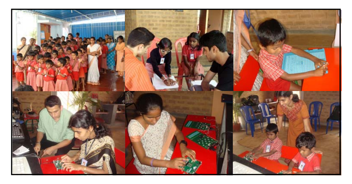
Figure 3: Field Tests at the Mathru School in India