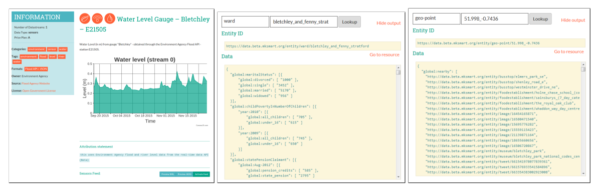
(a) Water Level Gauge - Bletchley - E21505.