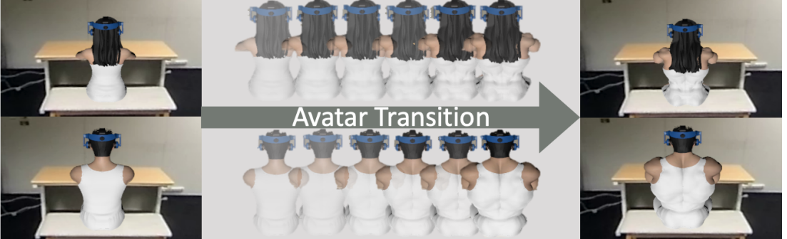
Figure 1: We explored the effects of graphical transitions to embody an avatar. From the upper left to the upper right: female normal body avatar, avatar transition, and muscular body avatar. From the bottom left to the bottom right: a male version of upper avatars.