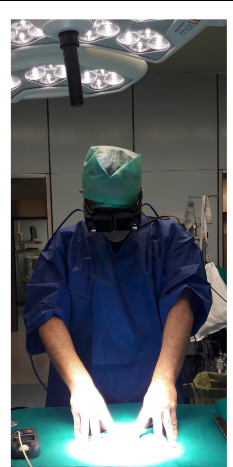
Figure 7: Worst-case lighting conditions in the surgical room under the scialytic lamp.