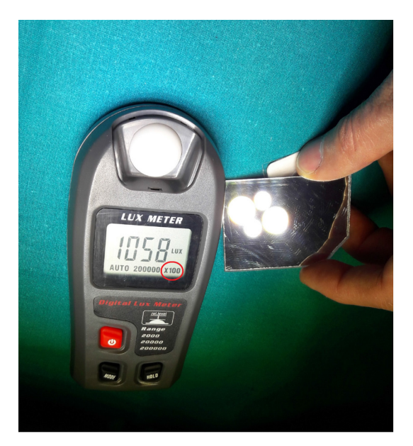
Figure 8: Illuminance measured in the surgical room with a mirror providing a direct reflection of the light source on the user's eyes.

Even if the electro-optical shutter is not able to completely obscure the light rays coming from the environment, it is enough to avoid double vision when the OST display is turned on. This means that the luminance contribution associated to the light rays coming from the world, after their passage through the electrooptical shutter, is negligible with respect to the luminance generated by the display itself. This effect is aided by the quasiorthoscopic camera placement that, together with the image warping, allow the quasi-perfect overlapping the real-world light rays with their corresponding pixel-wise reproductions coming from the optical engine of the OST. In this way, directions with high luminance are associated to pixel areas with high brightness and this effect avoids double vision also in presence of direct reflections of the light source to the observer's eyes (which can be considered a worst-case scenario).