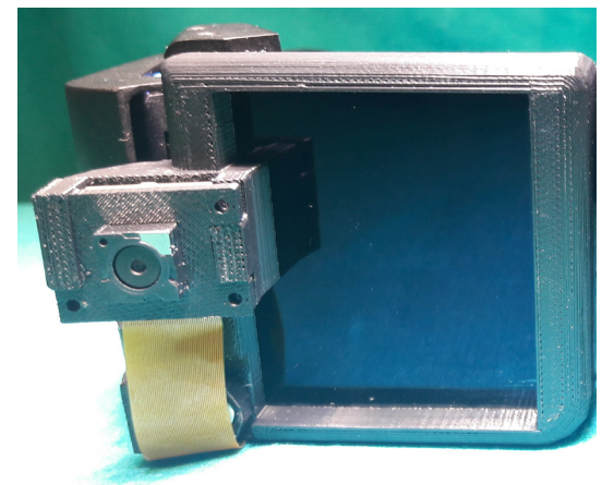
Figure 4: 3D printed external supports for electro-optical shutter and external camera. First row image with the shutter in open-state. Second row image with the shutter in closed-state.